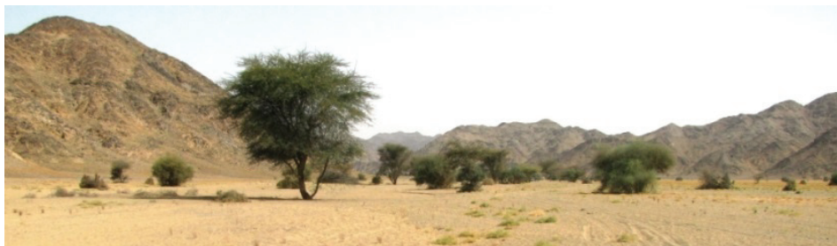
Figure 2. Panoramic view of Wadi Srob Kwan, where the specimens of Calopieris eulimene were recorded. Wadi Srob Kwan is characterized by bushes of the Desert Caper Capparis decidua , the food plant of the larvae of Calopieris eulimene .